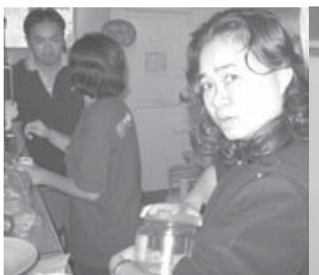
Gotcha! In camp Cam, there are eyes EVERYWHERE.

A total turnout of 79 students made it necessary to have six chalet families instead of five. While Camp Cam is a tradition, it was also a learning curve for the staff as many took up speaking at the main tract plus a chalet family was placed across the road!