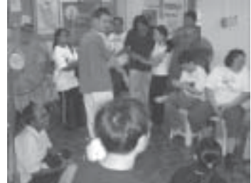
Visit to United Voice-Self-Advocacy Society of Persons with Learning Disabilities.