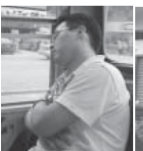
clockwise fr. top left: Team Taman Negara Staff taking a snooze in the bus trip, chatting up a local, preparing an item for service.