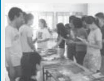
Books, books... booktable at the camp.