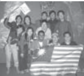
The graduates participants.

The marching in parade - they came representing their campus. Among them are: