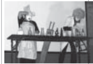
The opening act: The baker & mad professor- 'A call to be en.Zymers!'