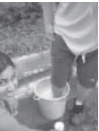
Special remedy for tired legs.