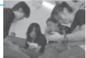
Prayer items were provided in the form of book marks.