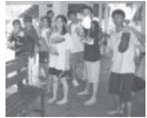
Sending of the 'disciples' - Take nothing except what's on you.