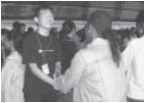
Day 1: It's "Hello"s all round!

National Conference (NC), 28th Nov-3rd Dec 05 @ PeaceHaven After 6 long years, NC came back, more than full house. Thanks to your generous support in prayer, finance, kind & manpower, it came to be!