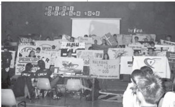
(Due to space constraint) ...and the rest :)