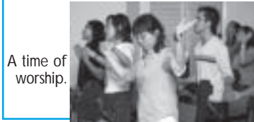
A time of worship.