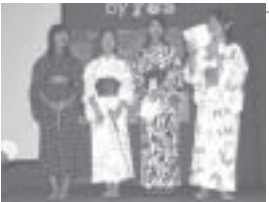
The delegation from Japan.

The marching in parade - they came representing their campus. Among them are: