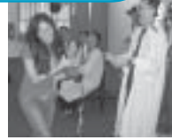
"Aiyo, shy la. Everybody's looking at me"