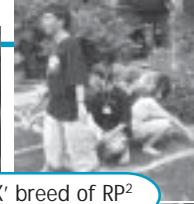
"You'll have to go through me first."