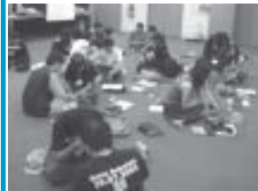
Sending off - Campers praying for each other.