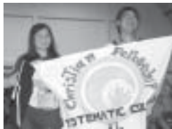
Systematic College, KL (now known as SEGi)