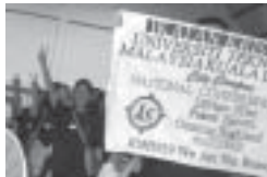
Universiti Teknologi Malaysia, KL