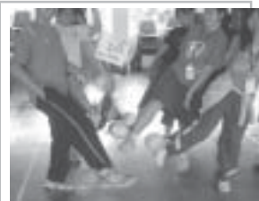
Group 'Chendering'; group names taken from small towns in M'sia - 'A call to be dispersed and serve.' Yup, that certainly requires willing feet.