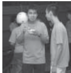
Time for refreshment and leisurely mingling.