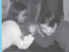
When we can't agree, 'wrestle' for it.

When things get stressful, the hula's always handy. (Incidentally, he was the best hula-hooper around!)