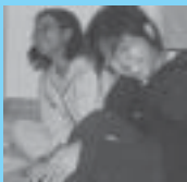
Of course, laughing A LOT helped us to keep sane.

The face of intense concentration, "Fuyoh, dun play-play!".