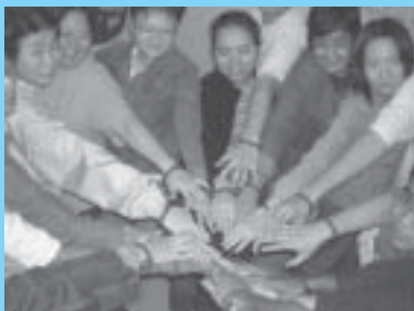
But one thing we all agreed, we will march on with our God, side by side, for the students!

So after all the planning, will we be on target? Time will tell!