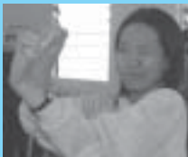
And after voicing all our opinions, there was - "I will still work with you" hugs all around.