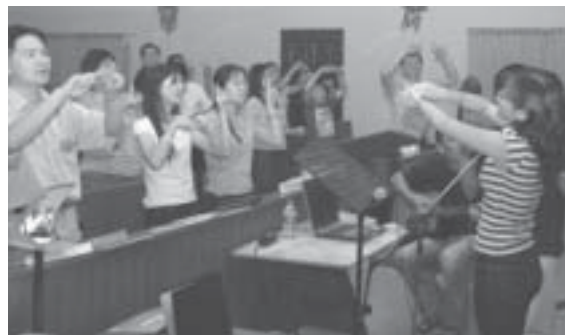
Worship cum exercising their fingers before the session.