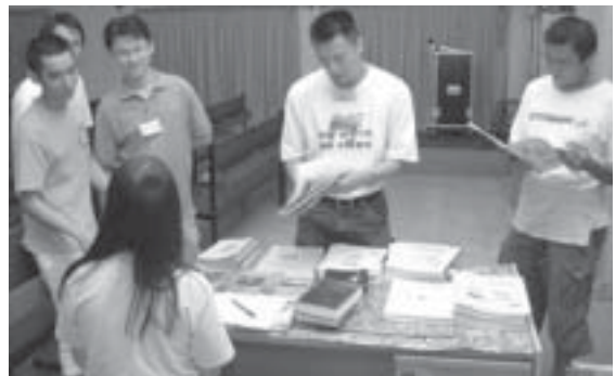
The booktable, not only provided a place to buy resources but also to catch up with each other.