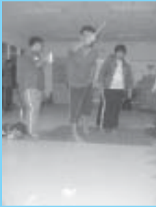
Methodology 1: Fishing for ideas.

Ever wonder what we do at the consultation as we plan for the year ahead? Here's some snapshots of how we raked our brains.